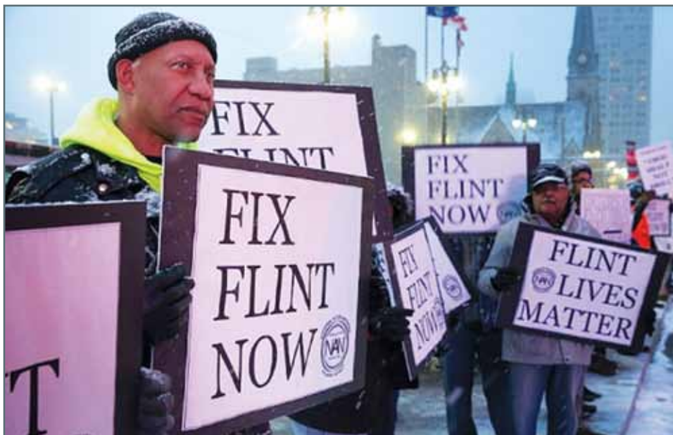
In Flint, Michigan, citizens protest their contaminated water.