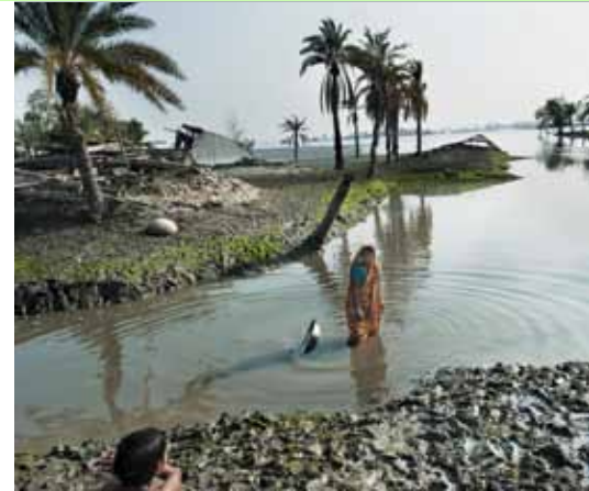
Bangladesh is among the countries most vulnerable to climate change. In the photo above, a woman stands where her house once was.